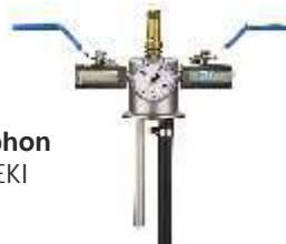
LN2-siphon Type EKI