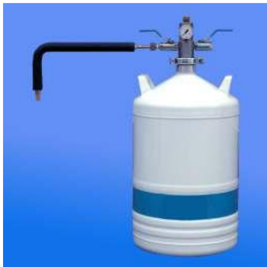
ALU 26 with