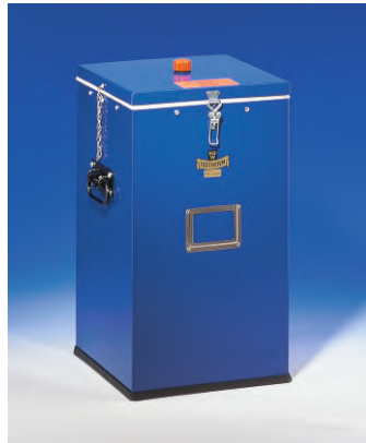
Dewar flasks type 131 - 135