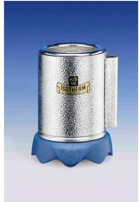
Dewar flask Type MRD 2011 for IKA color squid