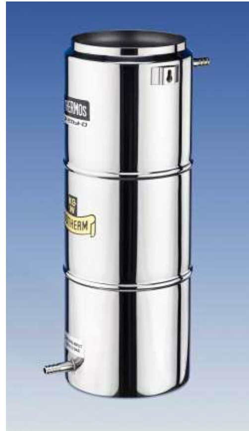
Tempering beaker type TSS-G