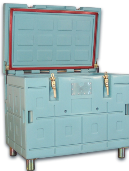
COB - Box 420