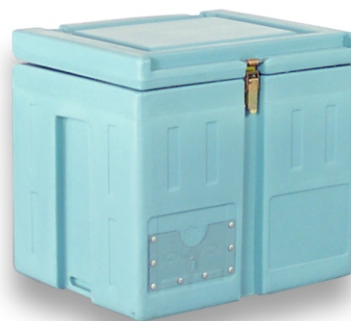
COB - Box 55