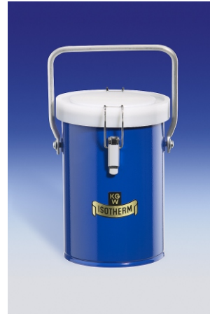
Dewar flask 26 B