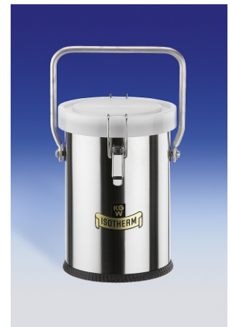
Dewar flask 26 B-E