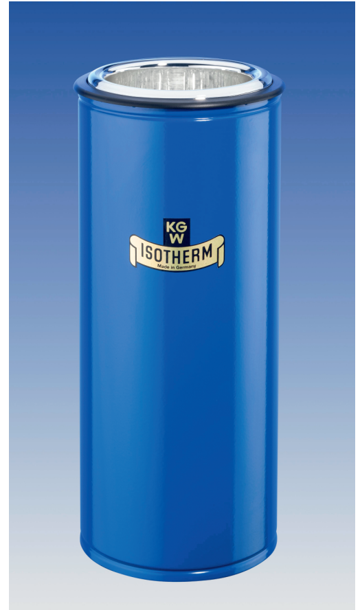
Dewar flask 9 C