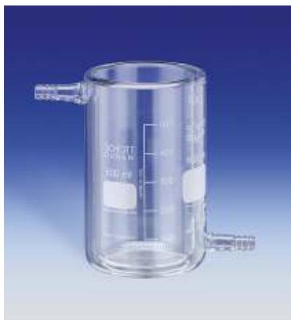
Tempering beaker type T