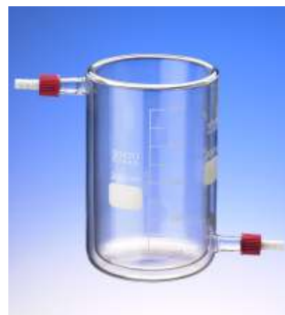
Tempering beaker type T-GL